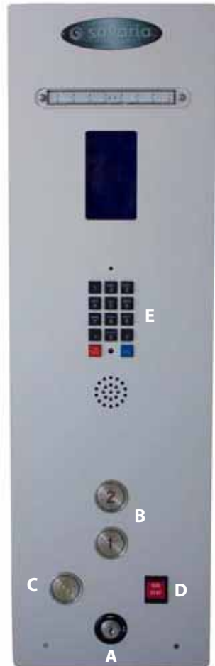
Figure 1: Sample COP

This button can be used at any time to stop the cab and activate the alarm buzzer.